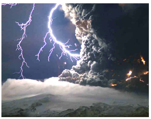
Fig. 1. General view of lightning discharges occurring in the volcanic hot smoke zone of an eruption containing fine solids in the ashes [9]

The goal of the paper is the development of a new hypothesis on possible additional mechanisms for the formation, accumulation and separation of electric charges in atmospheric clouds containing finely dispersed water droplets, small solid dielectric particles, and ice crystals. Let us emphasize that the term «hypothesis» used is derived from the Greek word «hypothesis» – «assumption» [4] and in the case under consideration is a scientific suggestion made to explain these electrophysical processes in an atmospheric cloud.