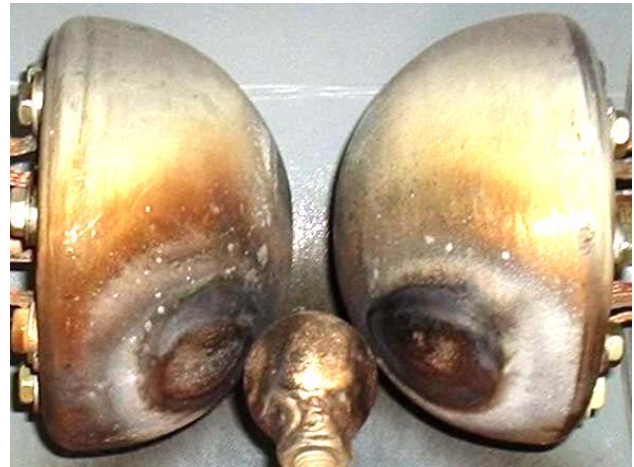
Fig. 2. Enlarged view of a three-electrode system of the cascade type HVCAS with two hemispherical massive main electrodes and one control electrode of a spherical steel Ст.3 marks on the rated voltage \pm 50 kV and a pulse microsecond current amplitude I_m up to \pm 300 kA (type after a single exposure at its electrodes in steel HVES discharge circuit with powerful pulse CSE damped sinusoidal current frequency \omega/2\pi = 4.9 kHz and amplitude of the first I_{ms} = -202 kA; J_a = 2,12 \cdot 10^6 J/ \Omega ; experimental channel radius value sparks r_{cm} \approx 31 mm length channel spark l_c \approx 13.5 mm)

This test was performed in the HVES discharge circuit with a powerful single-module CSE for a rated voltage of \pm 50 kV with nominal power capacity of its capacitor bank W_{g0} \approx 416 kJ (111 pieces of parallel-connected high-voltage capacitors of the type ИК-50-3) forming on the concentrated RL -load ( R_l \approx 10 m \Omega , L_l \approx 0.3 \mu H) LIC of microsecond duration [9, 14]. We will point out that the experimental HVES had the following electric parameters (up to the prefabricated steel buses of the CSE collector without taking into account the influence of the switch) [9, 14]: capacitance C_g = 333 \mu F; inductance L_g = 2.05 \mu H; active resistance R_g = 57 m \Omega . To switch the energy used by the HVES to the CSE a cascade-type HVCAS was used for a rated voltage of \pm 50 kV, containing two main massive hemispherical electrodes of radius R_e \approx 61.5 mm and one controlling a massive spherical electrode 30 mm in diameter made of steel of grade Ст.3 (Fig. 2) [7, 9].