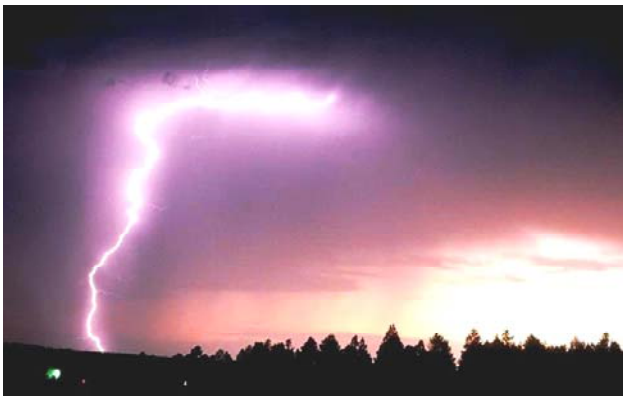
Fig. 1. General view of the brightly glowing plasma channel in the atmosphere of the long spark discharge of the LL between the positive charged cloud and ground [5]

Introduction. Well-known and most studied kind of powerful natural electrical short-time spark discharge in the air atmosphere of the Earth is the linear lightning (LL) [1-4], the appearance of which is shown in Fig. 1.