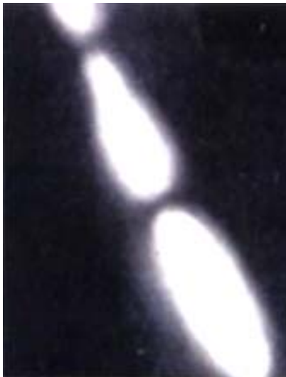
Fig. 3. General view of the individual «light» and «dark» rosaries of the RL observed from the ground in an air atmosphere [5, 6]